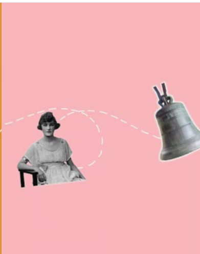
Perth CBD: Murder-and-Macabre true crime walking tour