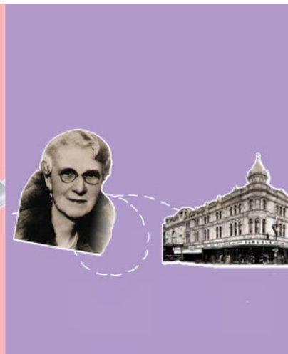
Perth CBD: Enterprising Women walking tour